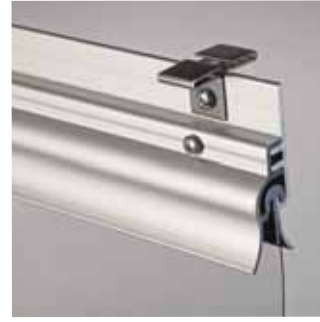
Standard T-bar clips come in 1", 1-1/2" and 2" sizes.