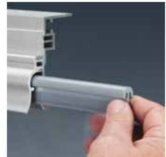
4. Curtains can also be inserted into the end of the assembled mounting rail and slid into place.

Call 1-800-854-7951 Today for a Quote, Specifications or Free Design Help