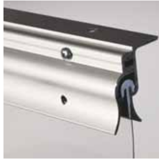
In-jamb ceiling mountings for mounting under headers, frames or horizontal surfaces.