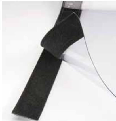
Hook and Loop Fastener – For securing curtain overlaps. Attaches with plasticizer-resistant adhesive and then sewn.