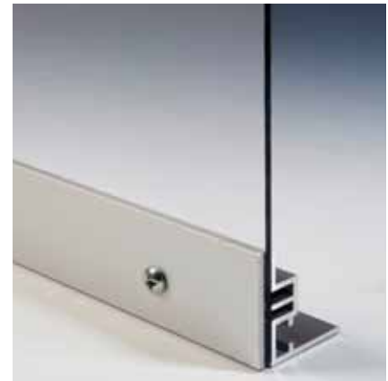
Mount the DCT track to the floor and use a batten strip to secure AirBlock curtains both top and bottom.