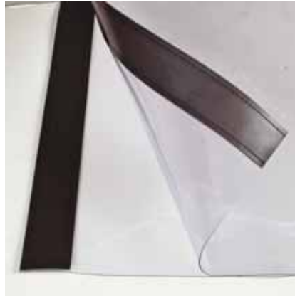
Flexible Magnet Self-Closures – Ideal for sealing overlap areas where frequent access is required. Chemical resistant.

AirBlock fastening options can be used to join two curtains together, or to also fasten curtains to racks in your data center.