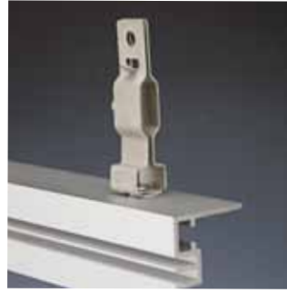
These clips come in two sizes to fit architectural grids commonly found in office buildings.