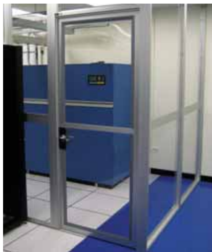
Other Door Options