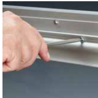
3. Overlaps are automatic and panels are perfectly aligned each time.