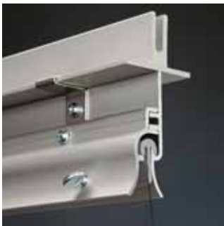
Suspended T-bar mounting onto existing 1", 1-1/2" or 2" suspended T-bar ceilings.