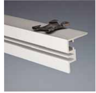
Caddy clips come in 1" and 1-1/2" (inset) sizes.