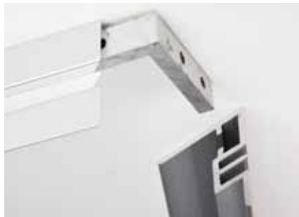
Corner modules of DCT tracks come together with internal splicing for a solid connection.