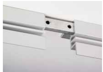
In-line splicing ensures a solid connection and rigid construction.

“The cost of data center curtains includes time spent in installation. AirBlock is an easy install.” – Shawn Mills, Green House Data