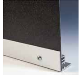
The DCT track can also be used to mount hardwall partitions in the data center.