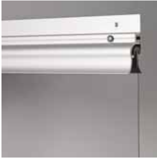
Flatwall Mounting for mounting on walls or vertical frames.