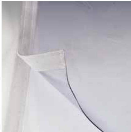
Dual Lock Fastener – A non-particulating, clear 3M flexible system uses a plasticizer-resistant adhesive. Ideal for attaching curtains vertically or horizontally to racks or overlaps.