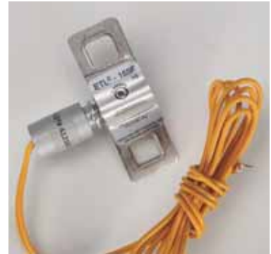
Electronic fuse link