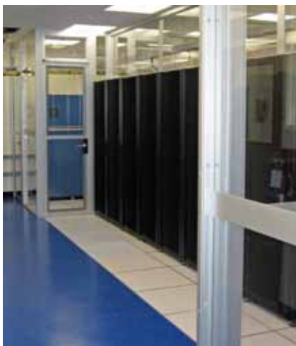
Data Center Partitions

Simplex also manufactures a complete line of hardwall panels for hot aisle and cold aisle isolation in the data center. Also see Simplex for door solutions, ceiling modules, blank fillers, CRAC enclosures and other data center cooling solutions.