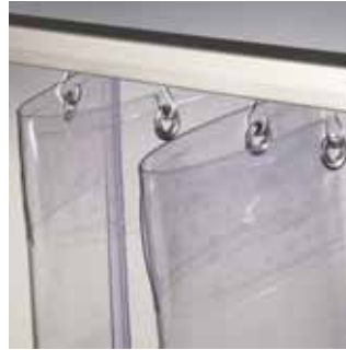
Bi-folding curtain mounting allows for curtains to be quickly pushed aside.