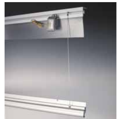
Upon activation, curtains and mounting fall far enough to allow sprinklers full operating range.