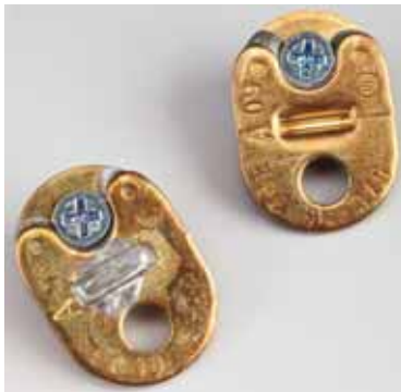
Standard fuse link, operates at 135°F

An alternative to fusible links are electronic fuse links, typically hardwired to your fire detection system and activated when smoke is detected. Simplex uses only UL approved fusible links.