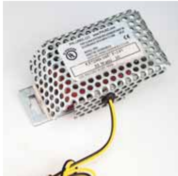
Reusable electronic fuselink.