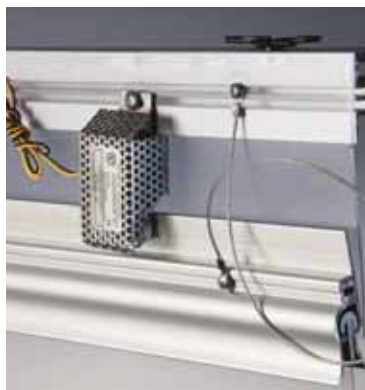
When installed, cables coil up and out of the way

When required, AirBlock can be installed using 18" lanyards. In the event of fire the vinyl walls and mounting railings fall far enough to allow fire sprinklers full operating range, however the stainless steel cables prevent the assembly from falling to the floor.