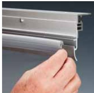
2. Unroll software panels and hook into place.