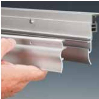
1. Mount the rear track. Self-threading, machine screws are provided.

The reputation Simplex has for long lasting curtains lies in our unique patented mounting system. Simplex bases all its mountings on a bead mounting that allows the curtain to pivot in the mounting, substantially reducing the stress on the curtain at the mounting point. This dramatically increases the life of the curtains.